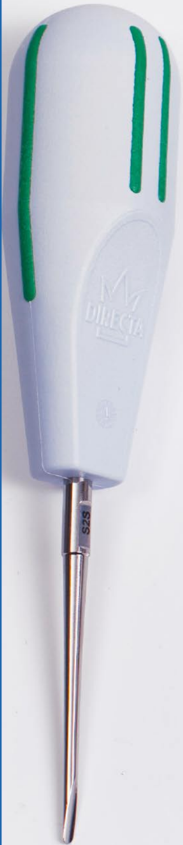
S2S Periotome 506358 2 mm Straight Short