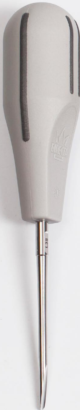
L3S Periotome 506340 3 mm Straight Standard