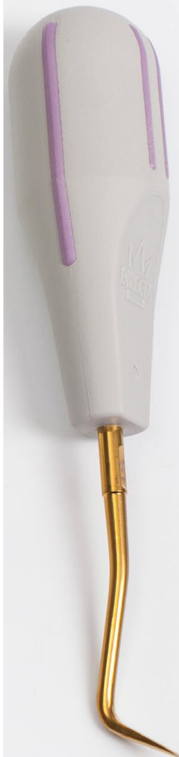
L3A TiN Periotome 506436 3 mm Angled Titanium