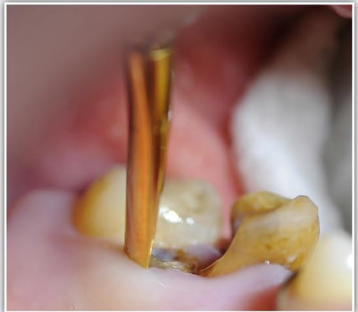
Activate the mechanical periotome and luxate at a low speed (2000 - 4000 rpm).