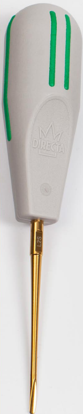
L2S TiN Periotome 506434 2mm Straight Titanium