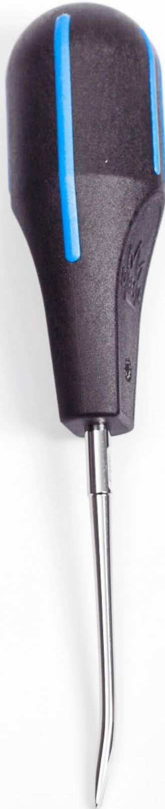
F32C Forte 506373 3,25 mm Curved Standard