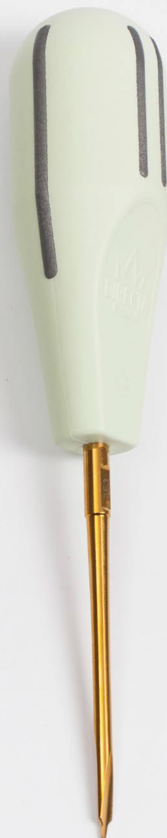
DE3 TiN Dual Edge 506435 3 mm Straight Titanium