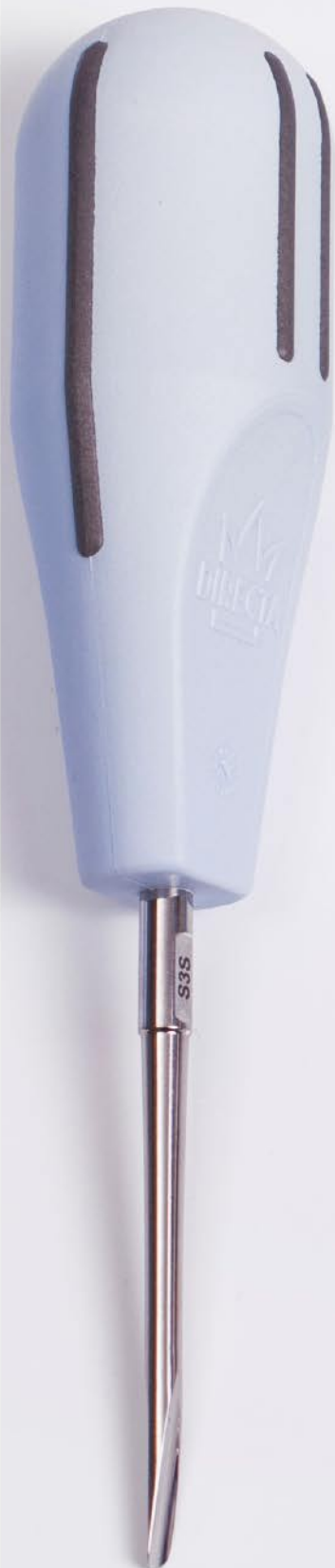
S3S Periotome 506360 3mm Straight Short