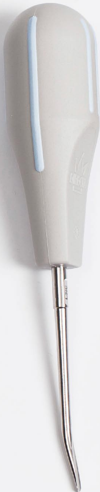
L3IC Periotome 506354 3 mm Inverted Curved Standard