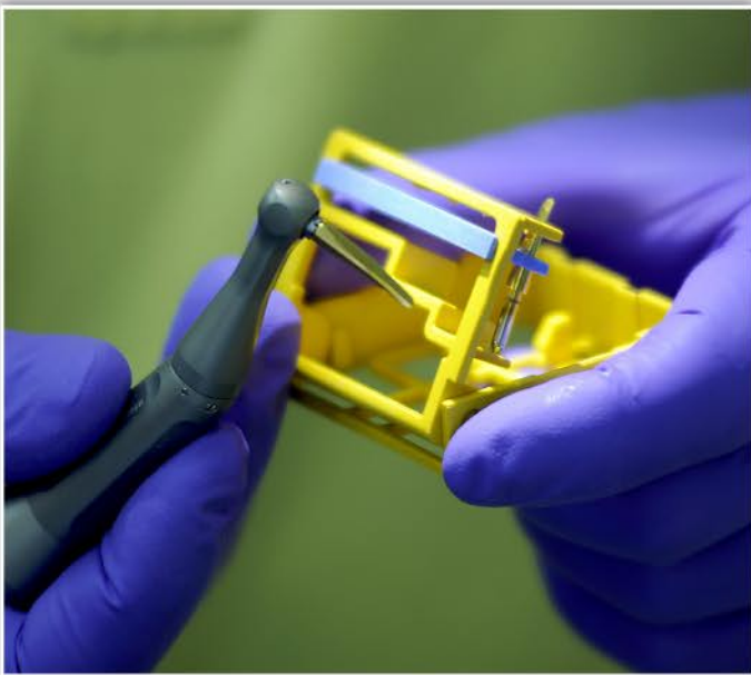
Insert the Periotome Tip into the handpiece, starting with 2mm tip.