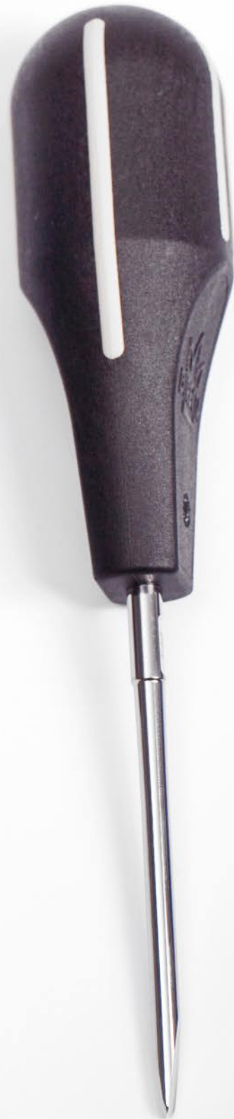
F40 Forte 506372 4 mm Straight Standard