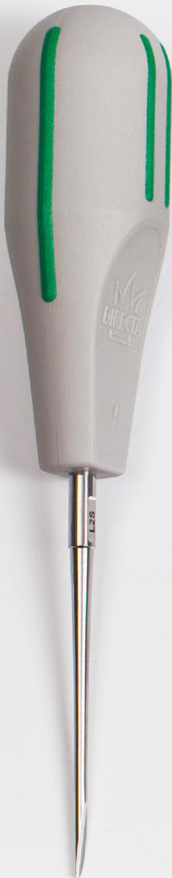
L2S Periotome 506352 2 mm Straight Standard