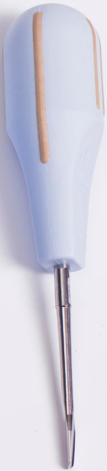
S5S Periotome 506362 5 mm Straight Short