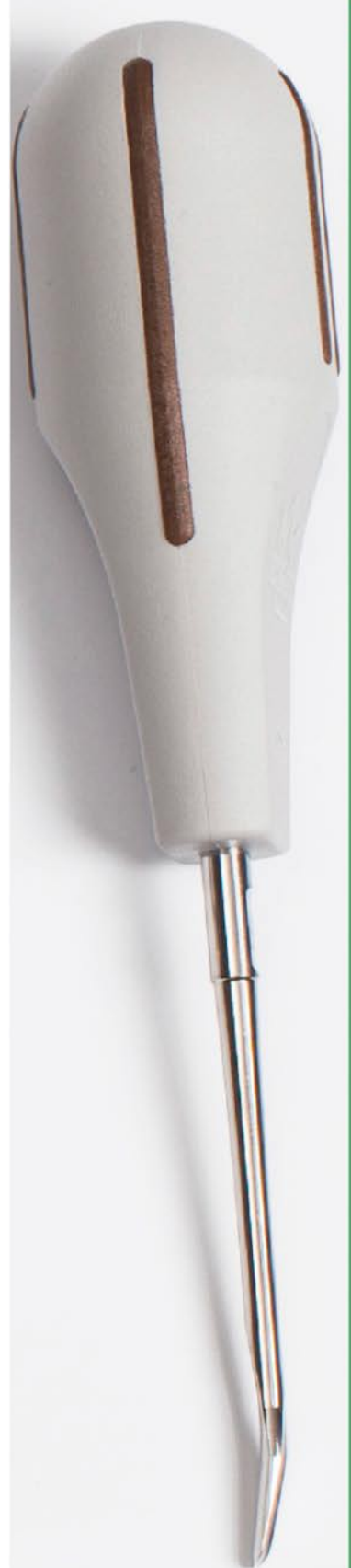
L5C Periotome 506342 5 mm Curved Standard