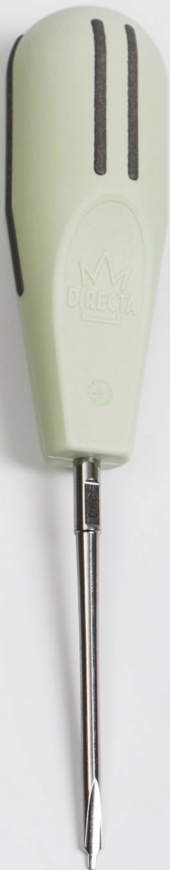
DE3 Dual Edge 506356 3/1.5 mm Straight Standard