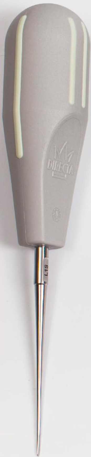
L1S Periotome 506355 1 mm Straight Standard