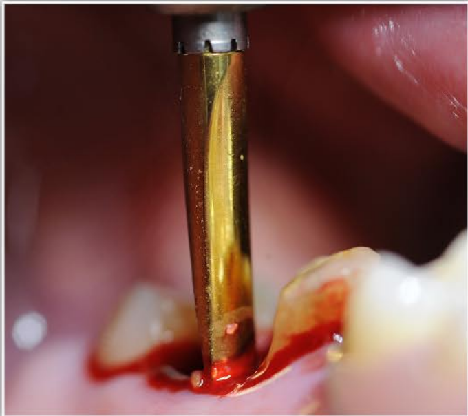
Let the Periotome Tip work around the tooth to cut the periodontal fibers. Press firmly and follow the surface of the root.