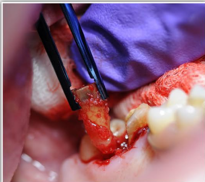
Remove the tooth with ordinary forceps or Luxator RootPicker.