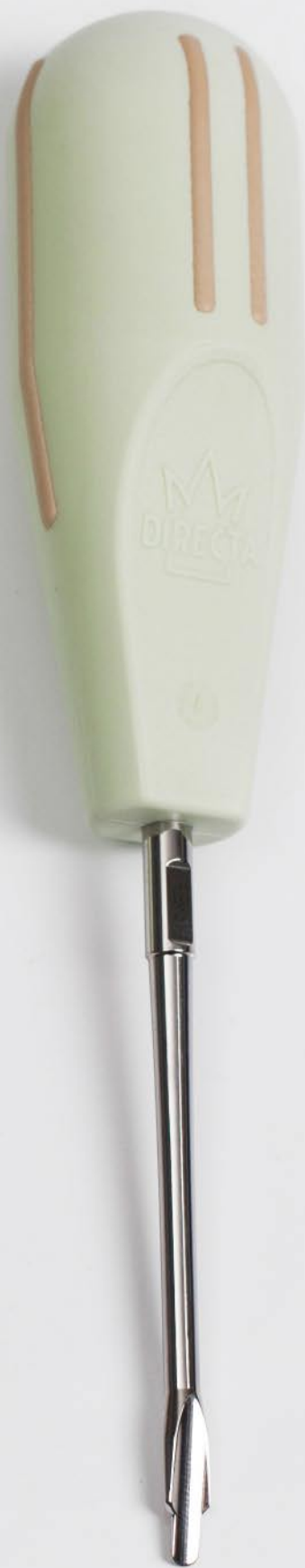
DE5 Dual Edge 506357 5/3 mm Straight Standard