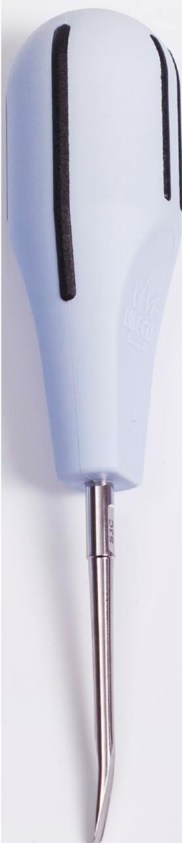
S3C Periotome 506359 3 mm Curved Short