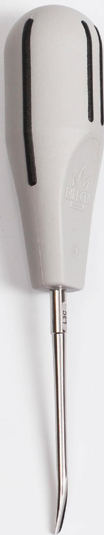
L3C Periotome 506341 3 mm Curved Standard