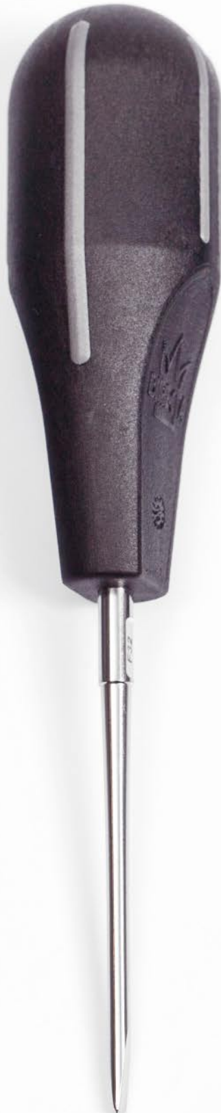
F32 Forte 506371 3,25 mm Straight Standard