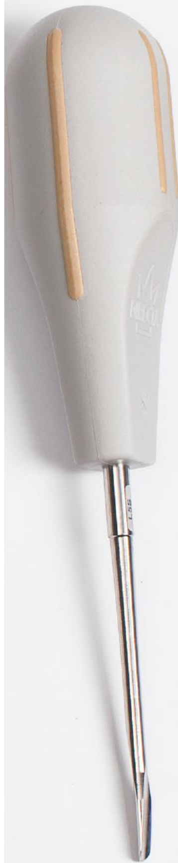
L5S Periotome 506342 5 mm Straight Standard