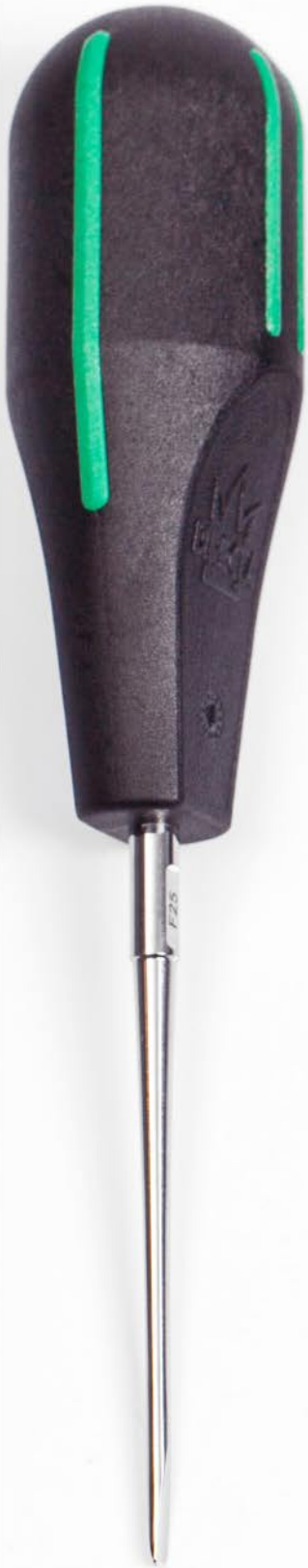
F25 Forte 506370 2,5 mm Straight Standard