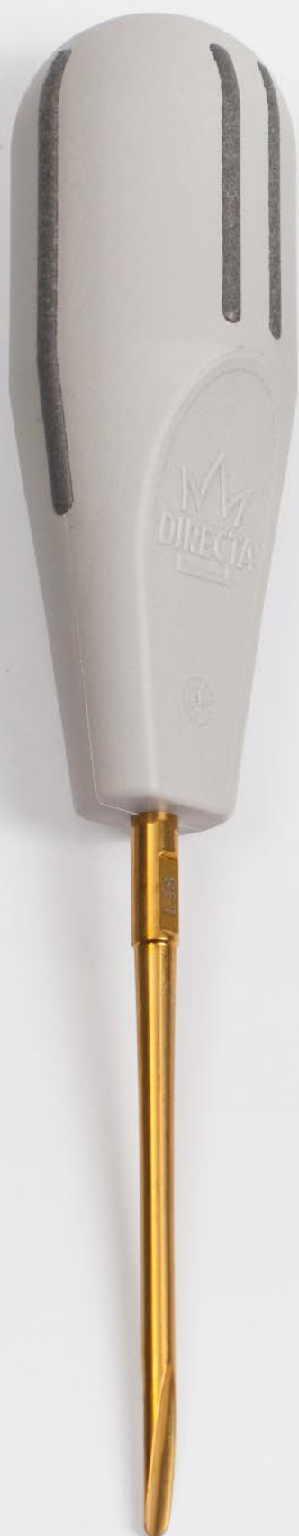
L3S TiN Periotome 506433 3mm Straight Titanium