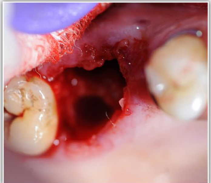
Successful extraction with minimal tissue damage.