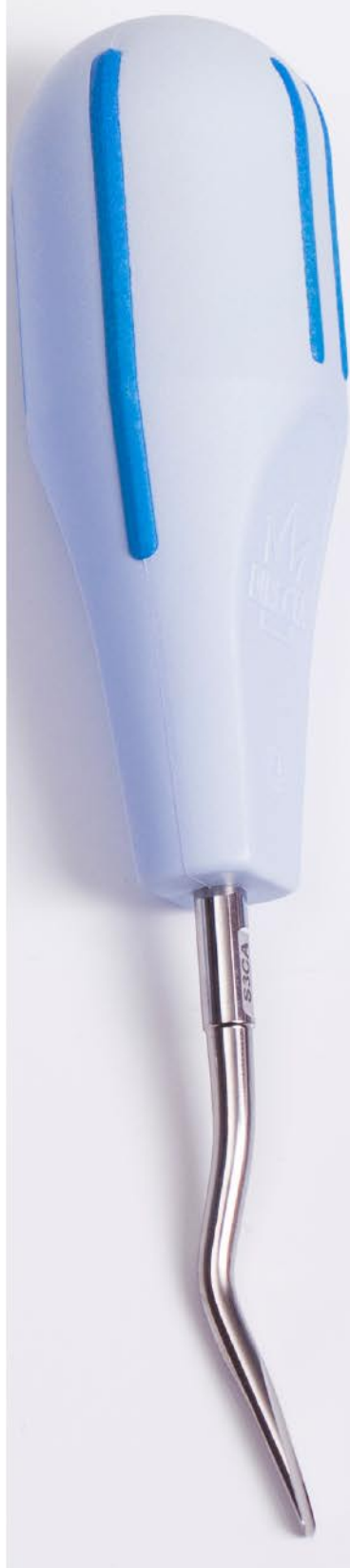
S3CA Periotome 506361 3 mm Contra Angle Short