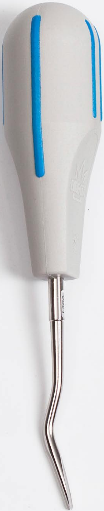
L3CA Periotome 506353 3 mm Contra Angle Standard