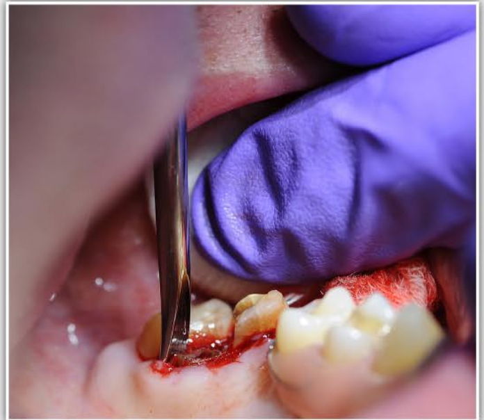
Use a Luxator Forte to judge the actual luxation status. If necessary continue with Luxator LX. If entering is hard, try to get an access point with a thin Luxator Periotome and then continue the luxation with Luxator LX.